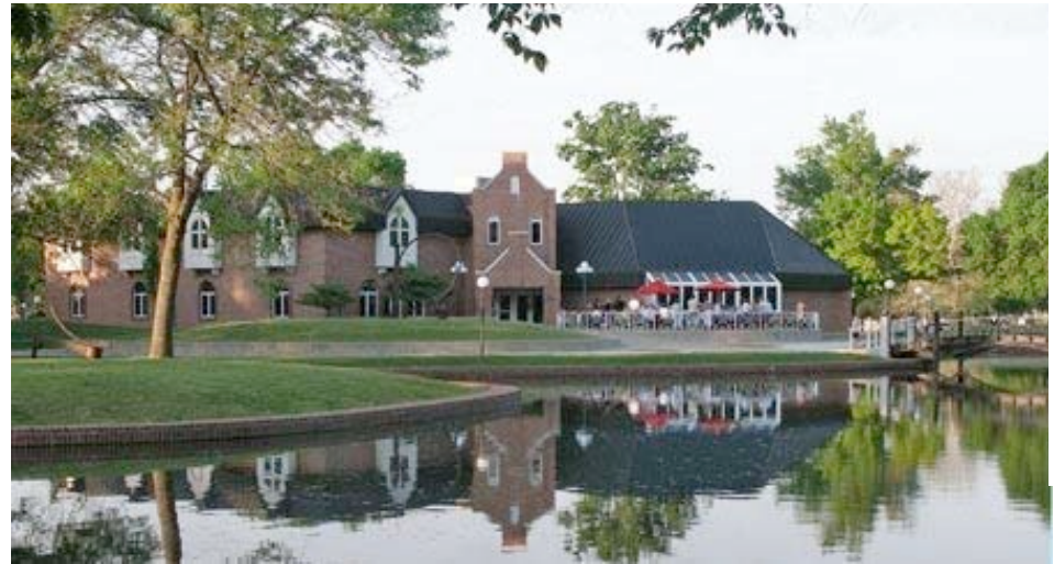
The 2009 Iowa HOBY Seminar was held at Central College in Pella, Iowa