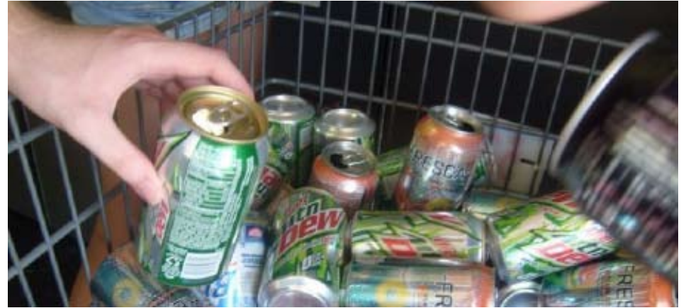
Alumni collected cans in June as a fundraiser